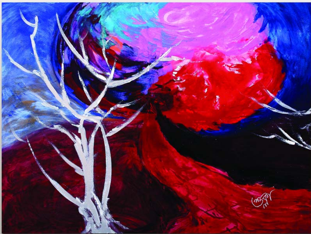
After the Storm Has Gone